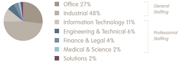
2012 Revenue split by business line in %